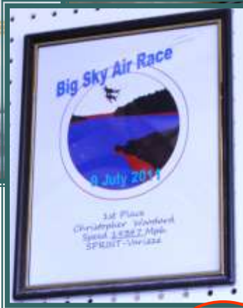
He continues to modify and winning races.